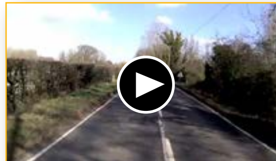
Talking through System on an overtake

In the final stages of the overtake it was not necessary to re-visit the speed or gear phases as these had already been sorted out, it was simply a matter of changing position and going straight to the acceleration phase. Check out our overtaking download too.