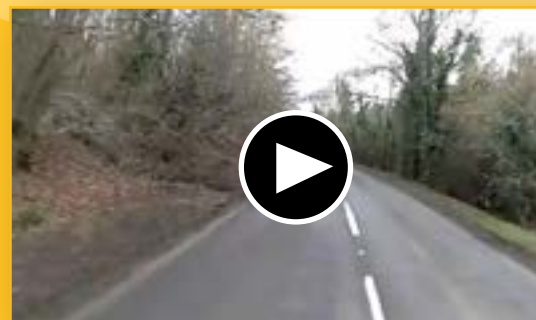
Talking through System on approach to a corner.