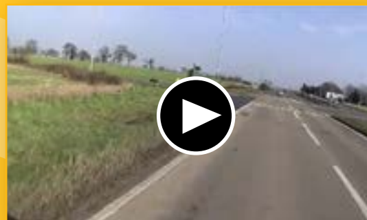
Talking through system at junctions

Maintain the speed through the hazard by gentle acceleration and accelerate out of the corner to an appropriate speed.